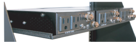
Fig. 3 DC inputs, AC outlets, and grounding studs should be on the back of the inverter so they are close to wiring connections and allow for the shortest cable runs.

If the inverter is intended to be installed in an equipment rack as part of a power system, the input connectors, AC outlets, and grounding stud should all be located on the back, close to where the wiring connections need to be made, so that cables do not have to be run around to the front of the rack.